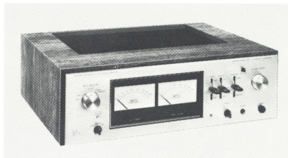
5L15 shown in optional vinyl-clad, simulated wood-grain cabinet.