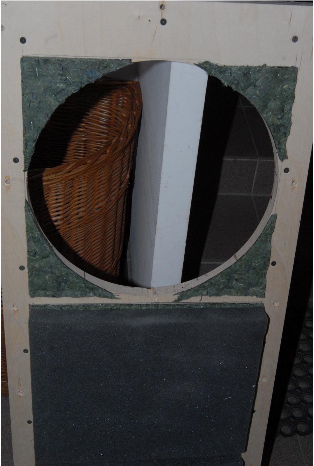
Front element dumped also with 3 layers