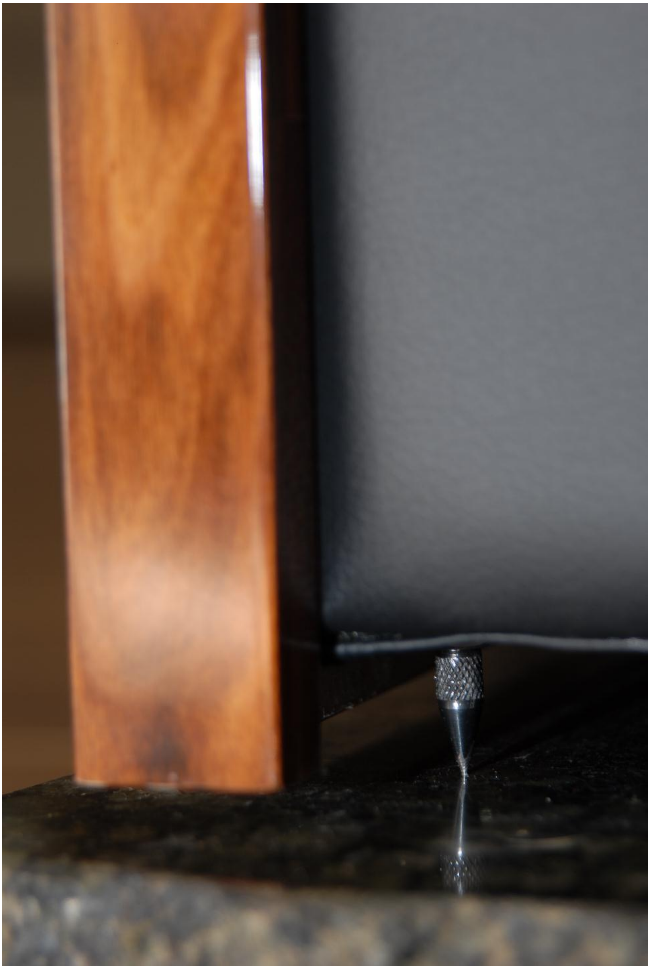
Speakers are standing on 3 spikes.