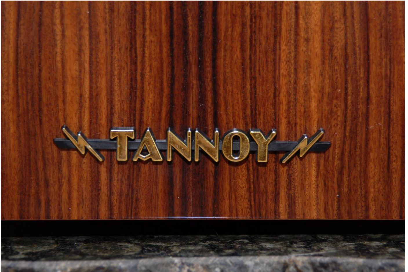
Original Tannoy medium size badge added.