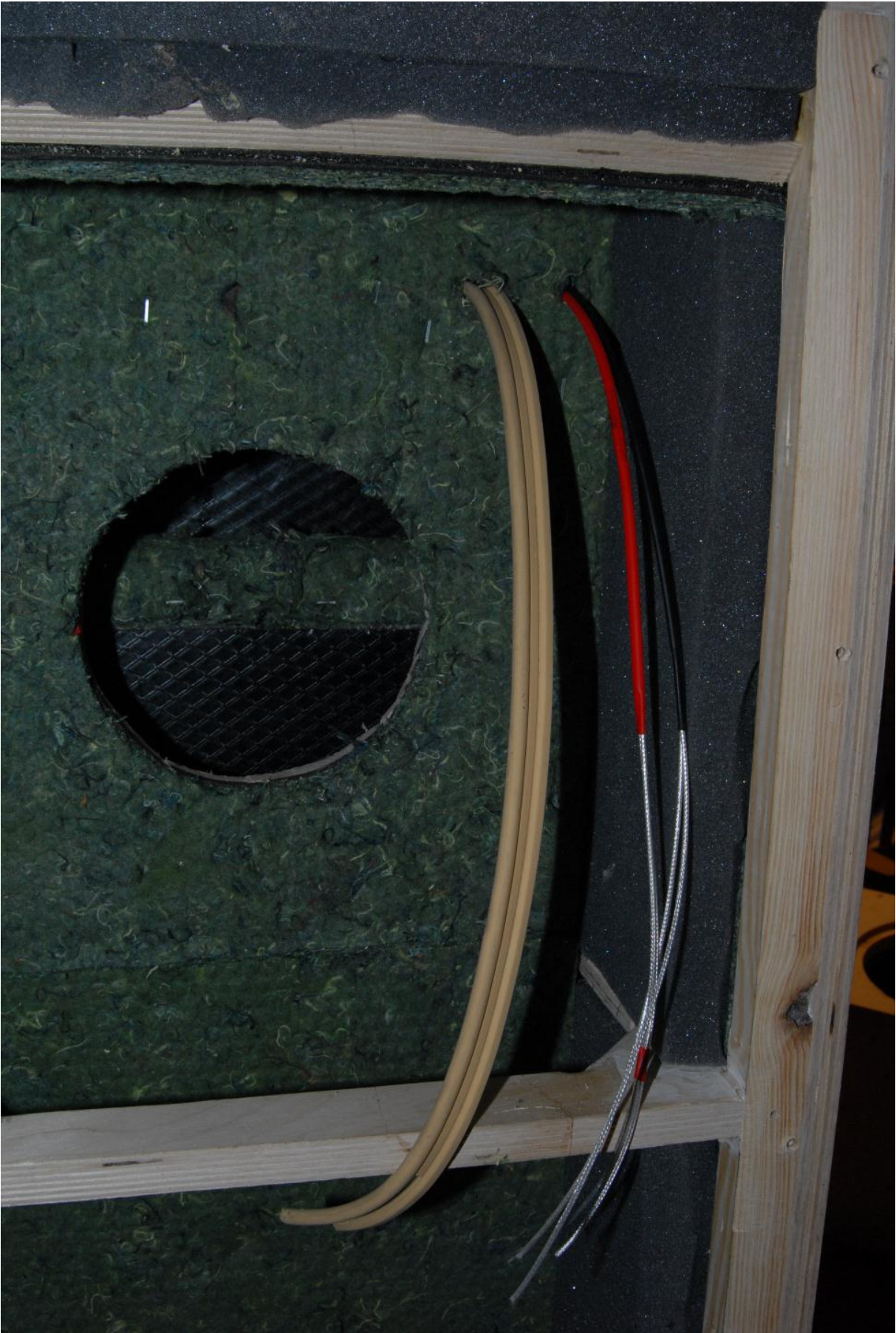
Cables: Van Den Hull for LF and so called "New Silver", doubled, for HF