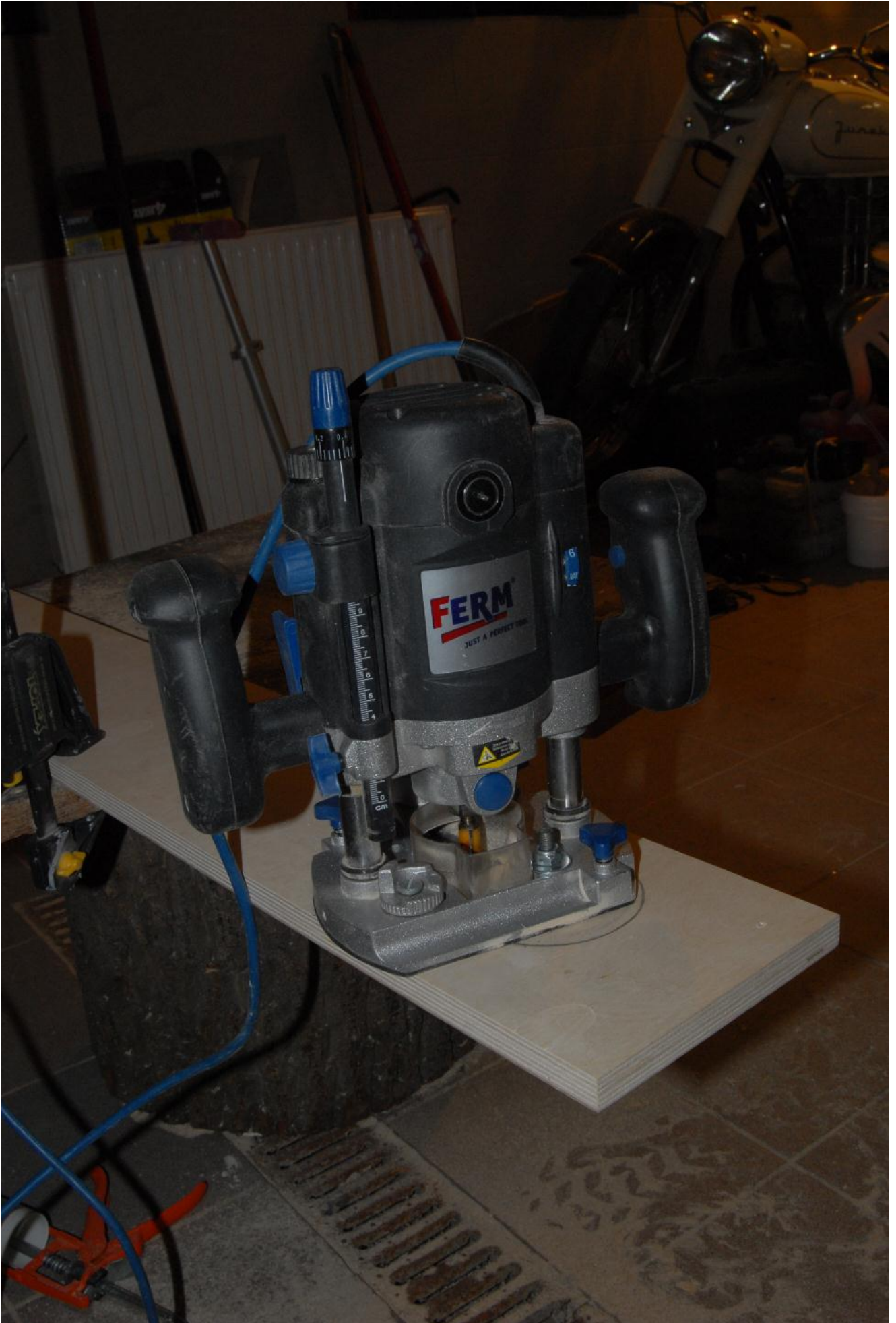
Cutting out the hole for crossover access.