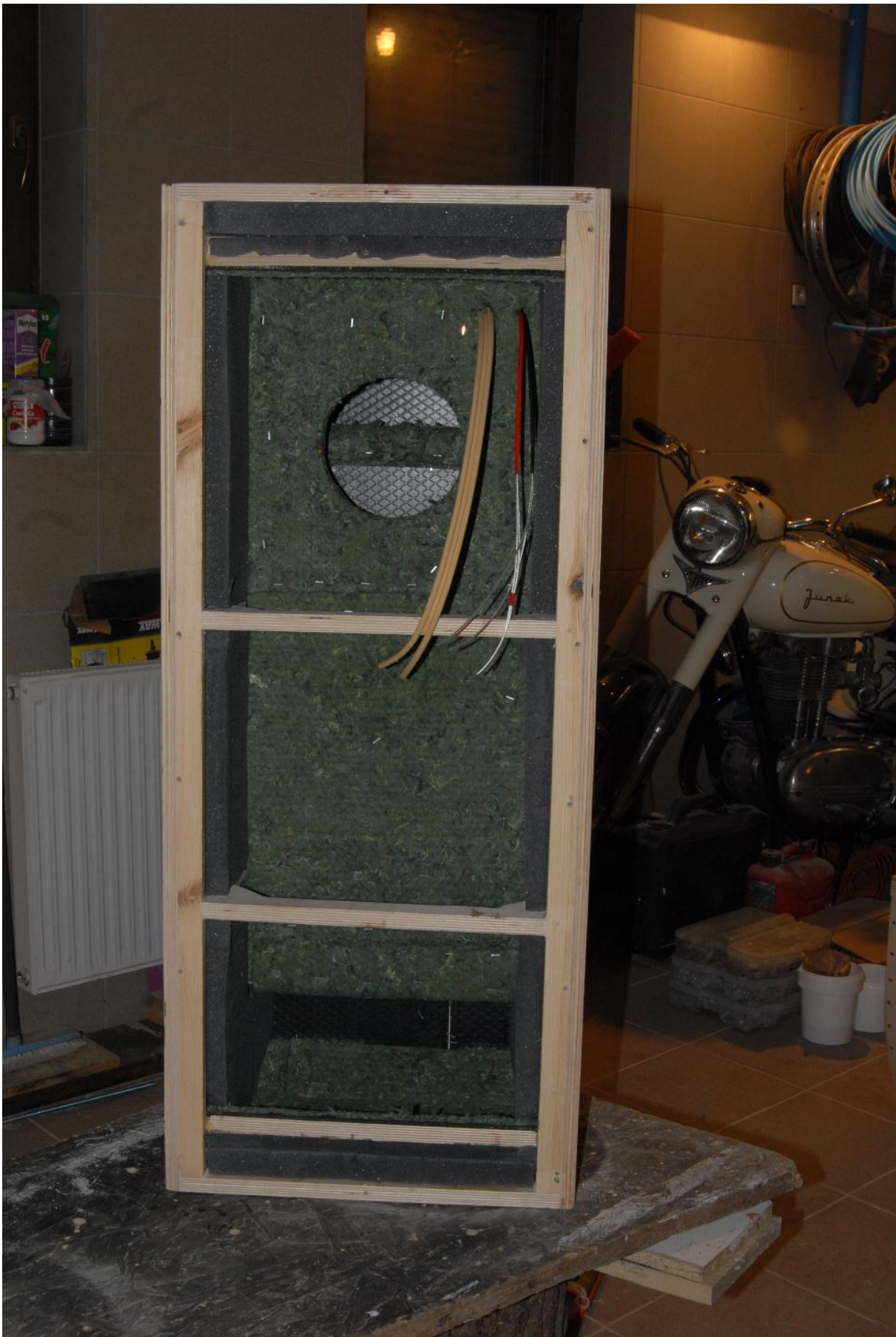
General overview of the inside.