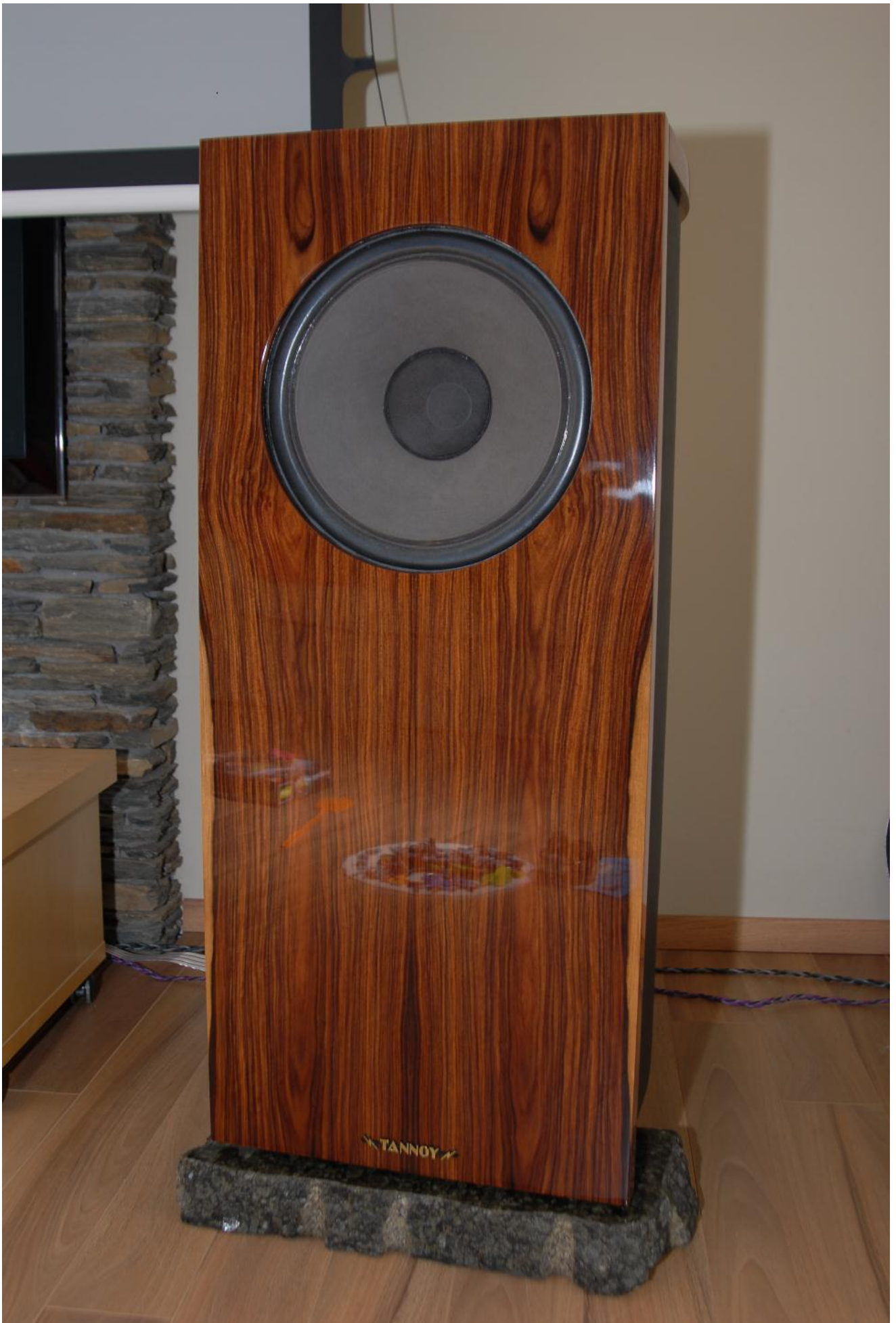
Final result. My daughter's toys on the floor reflected☺.