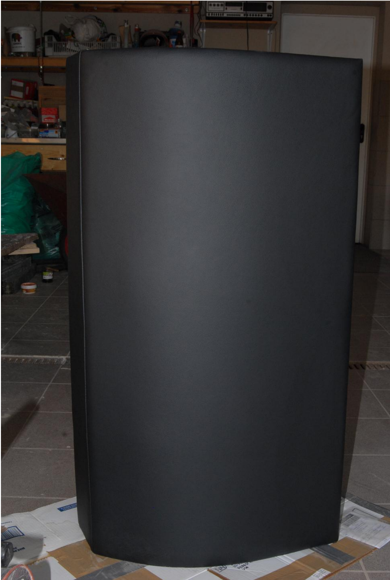
Natural leather finish with no sewing on the sides of speaker 😊.