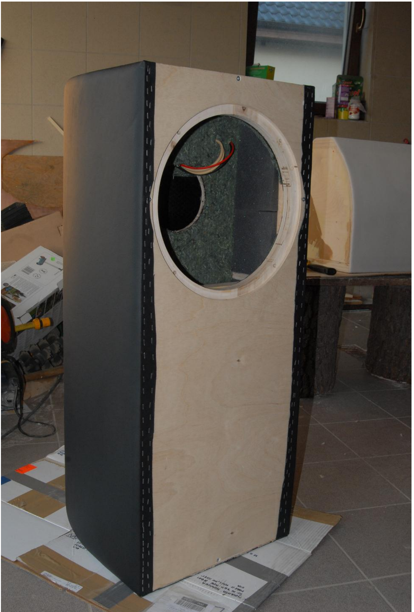
No glue, just staple it on the front element.