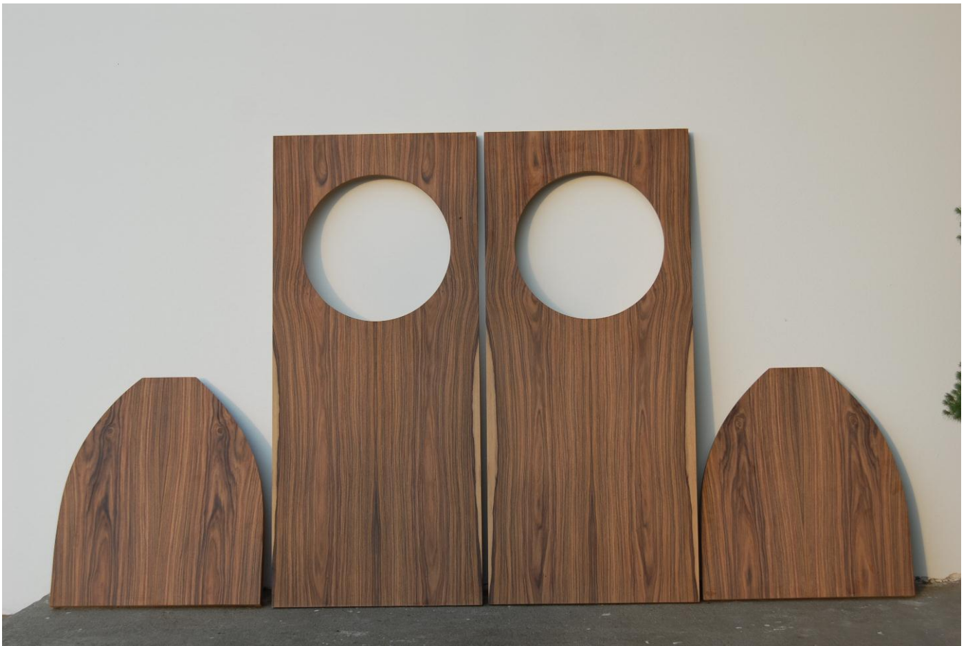
Front and top finish elements made with 18 mm plywood, veneer palisander before staining (done by professionalist, high gloss staining too)