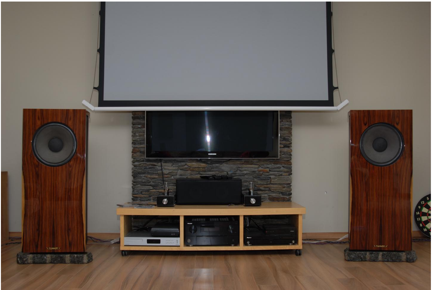
Full view of system.