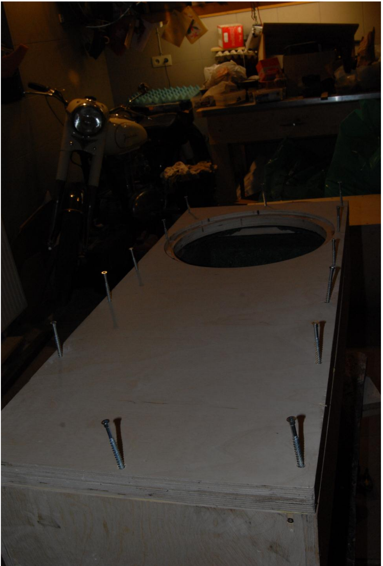
Front element screwed in for testing