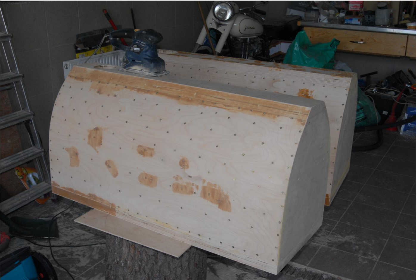
Cabinets ready for final "shaping". Sides screwed and glued together with 3 layers of 5 mm plywood. All the inner corners were sealed with silicon BTW.