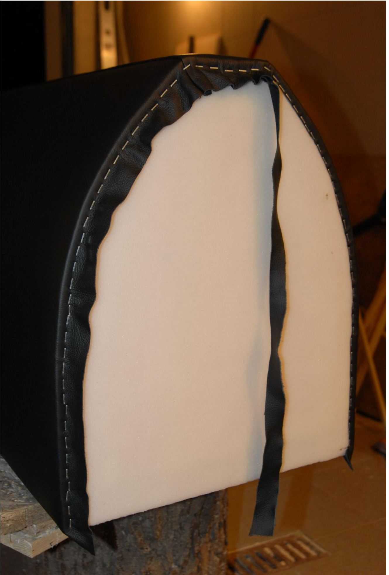
The bottom of speaker.